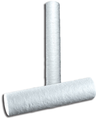
Figure 1 : Purtrex Depth Cartridge Filters