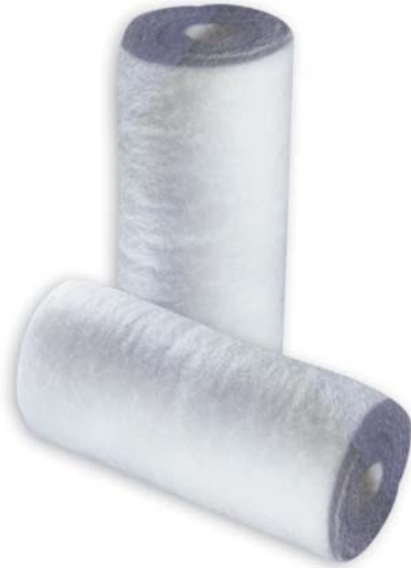
Figure 1: MBB Filters